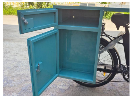
- Rear Cabinets -