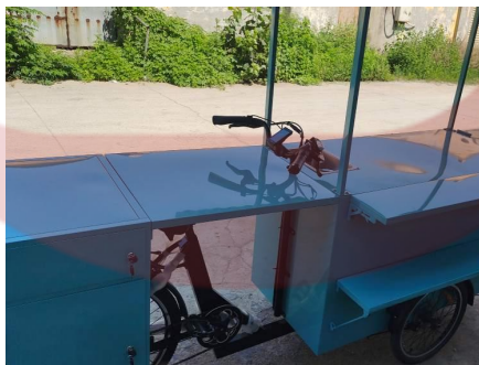
- Fold Down Counter -