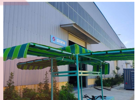
- Umbrella -