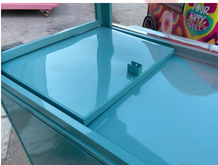
- Fold Down Counter -