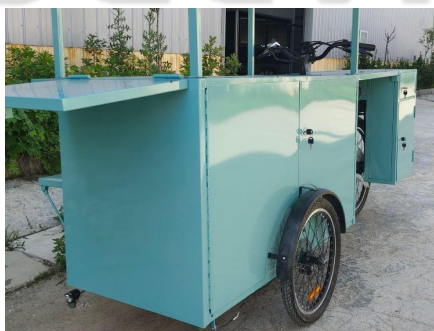
- Front Cabinet -