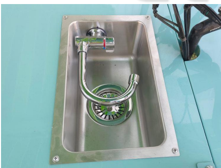
- Water Sink -