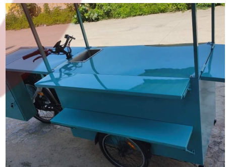
- Display Shelf -